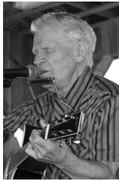
Doc Watson MerleFest 2007